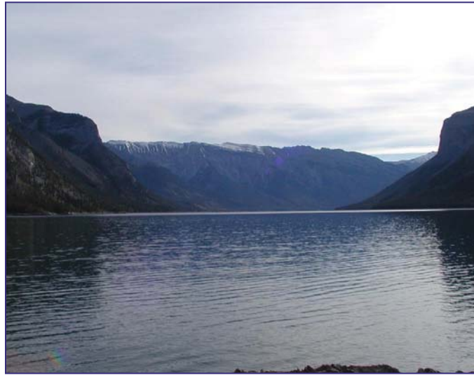
Lake Minniewanka TransAlta reservoir high in Banff National Park.